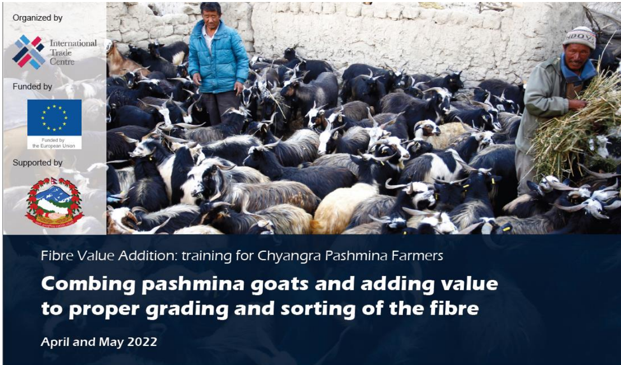
Figure 1 One-pager flyer with brief information about training in combing and value addition of fibre

The International Trade Centre and the Nepal Pashmina Industry Association will organize farmer training in the gaunpalikas of Lomanthang, Lo-Ghekar Damodarkunda, Baragung Muktichhetra and Gharapjhong.