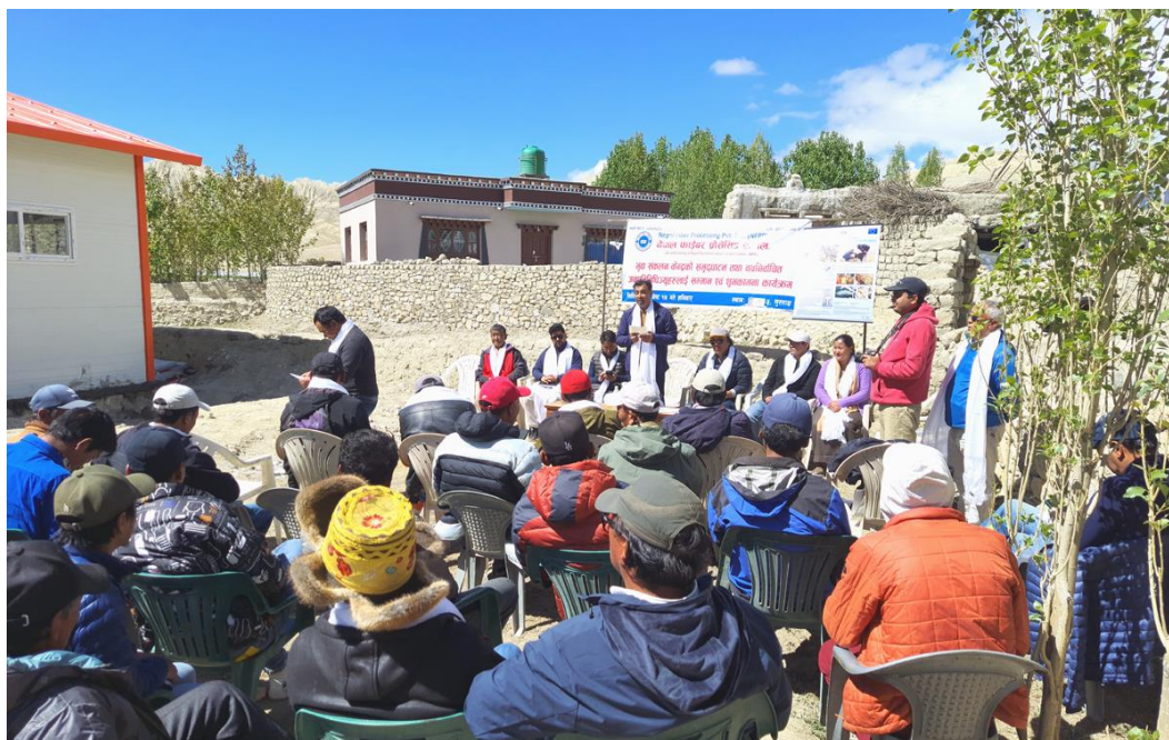
Figure 6 Inauguration of Pashmina fibre collection centre at Lomanthang

On May 28, 2022, the newly constructed modern design Pashmina fibre collection centre was inaugurated by inviting two Guanpalika representatives from Upper Mustang (Chairman, Vice-Chairman, and ward chairman).